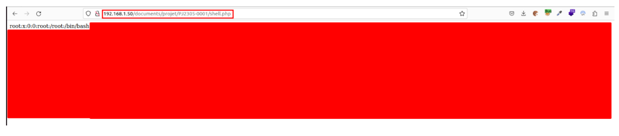
FIGURE 6: WEBSHELL EXECUTION.

In case of Dolibarr environment is not correctly configured and "documents" directory is exposed by the web server, we can reach the uploaded files which means execute a webshell: