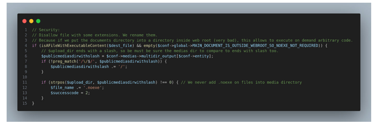
FIGURE 3: PART OF DOL_MOVE_UPLOADED_FILE (HTDOCS/CORE/LIB/FILES.LIB.PHP).

The code responsible for this behavior is the following, which basically before writing the file to the disk, checks if the original file extension matches with one of the blacklisted ones: