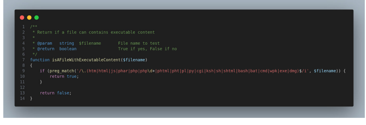
FIGURE 4: ISAFILEWITHEXECUTABLECONTENT FUNCTION (HTDOCS/CORE/LIB/FUUNCTIONS.LIB.PHP).

Another Dolibarr pre-installed module is "API / WEB SERVICES" which enables a REST server and lets the users do all kinds of actions through API calls. One of these actions is the document upload and after analyzing the related class (htdocs/api/class/api_documents.class.php), it was noticed that excepting some